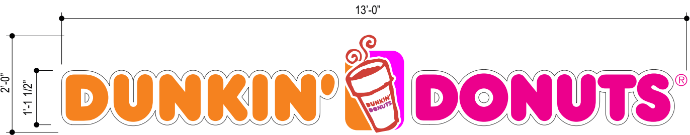
2A ELEVATION DETAIL SCALE: 1/2" = 1'-0"